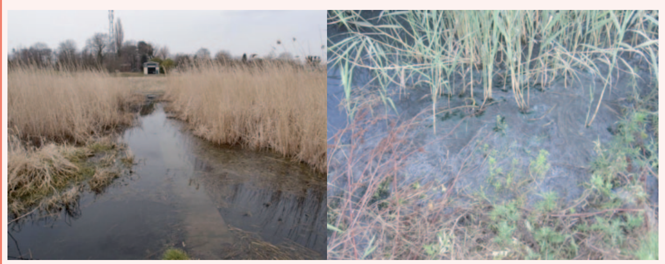
Figure 4: Examples of clogged horizontal flow wetlands (a) Hydraulically linked UK tertiary wetland cells and (b) Surface ponding and hydrogen sulfide generation in secondary wetland in Italy. Picture (b) courtesy of IRIDRA Srl.

efficiencies, respectively. Like in the USA example, the site was refurbished due to health and safety concerns, that is, to ensure the water remained within the wetlands rather than due to deterioration in treatment performance.