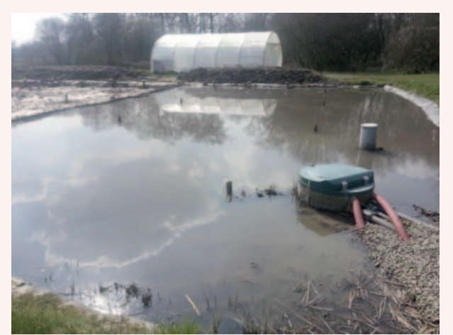
Figure 7: Example of 1<sup>st</sup> stage clogging in a VF CWs system.

Second stage clogging in the French VFCW system is more frequent as finer material are employed (coarse sand). The failure are mostly linked to problems including poor treatment in the first stage which bring more solids on the second stage, poor distribution and drainage systems, and poor organic solids degradation. These are similar to issues encountered in conventional secondary VF CWs and present a problem as they limit oxygen transfer into the bed matrix.