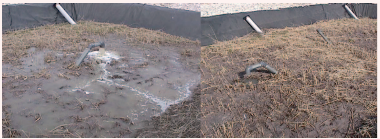
Figure 2: Example of 1st stage VF Wetland with ponding during feeding. The water flow preferentially over the top of the bed around inlet points and the percolates.