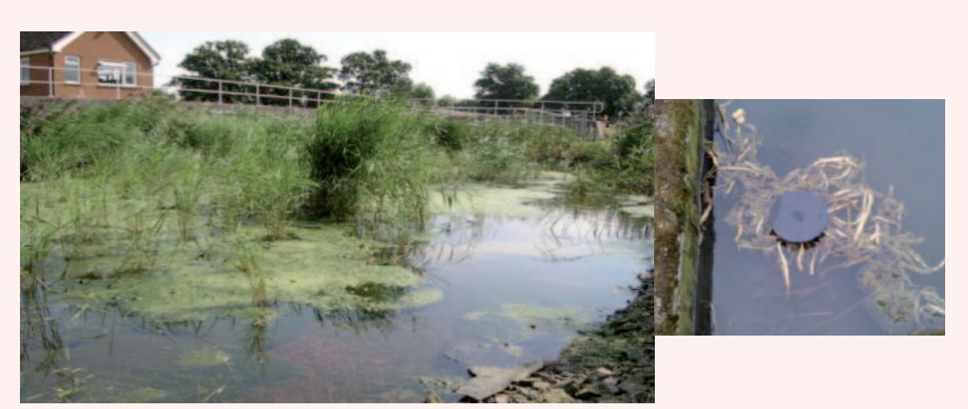
Figure 1: Example of subsurface flow wetlands with surface flow during high flow conditions. The water flows preferentially over the top of the bed and will result in partially treated water exiting through the overflow pipe and blending with the treated effluent at the final collection point.

Accumulation of water on top of subsurface flow wetlands is only problematic for some HSSF, as it can enable solids carryover across the length of the bed, and in VF wetlands if ponding remains between batches. Temporary surface water accumulation in VF CWs is part of normal operation (Figure 2) and, as such, fundamentally different from clogging. Surface water in HSSF can also occur due to poor operational practices where water level is poorly regulated (i.e., kept above the surface on purpose) and in some cases, unrelated to clogging as well. In both of these cases, there were only positive effects (VF CWs) or no effect (HSSF) on overall performance of the beds.