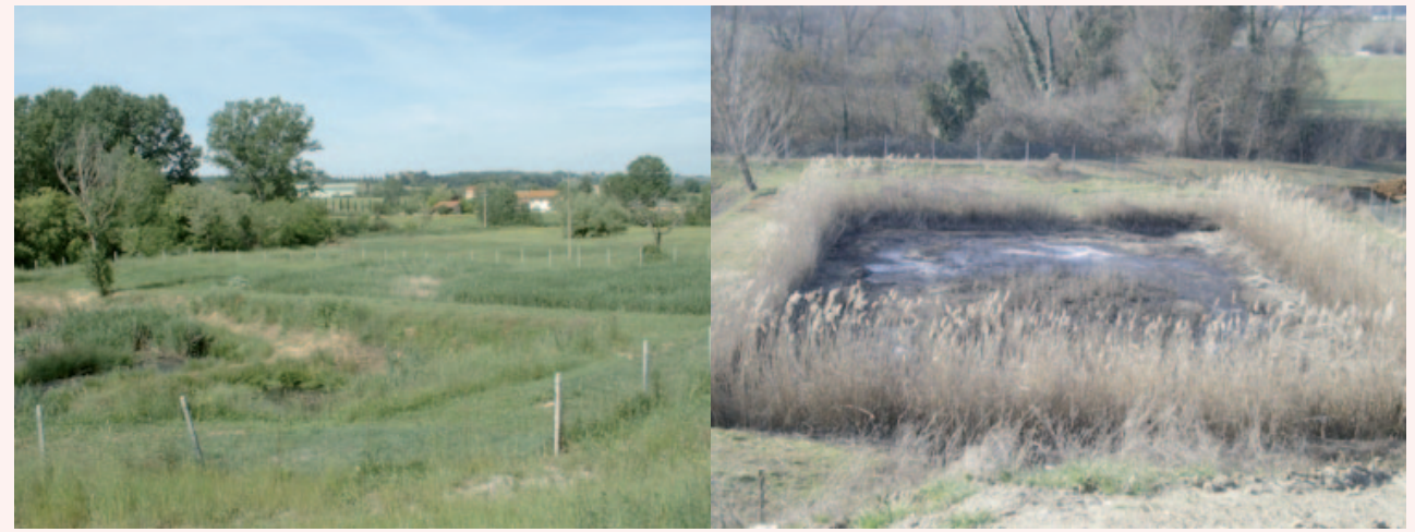
Figure 6: Winery horizontal flow wetland (a) before and (b) after clogging developed. The loading rate onto the wetlands was three times the design load by the time clogging became permanent.

Figure 5: Relative cost comparison for a conventional tertiary HSSF sized at 1 m<sup>2</sup>/pe (assumed asset life is 8 years), a wetland designed at 3.1 m<sup>2</sup>/pe (designed for 18 years) and a conventional sand filter plus storm tank for an example small works serving 300 pe and 2000 pe. The difference between the two wetlands are the refurbishment intervals vs capital cost of a bigger wetland. All costs calculated based on Severn Trent Water's standards for 2010-2015. Adapted from Dotro et al. (2012).