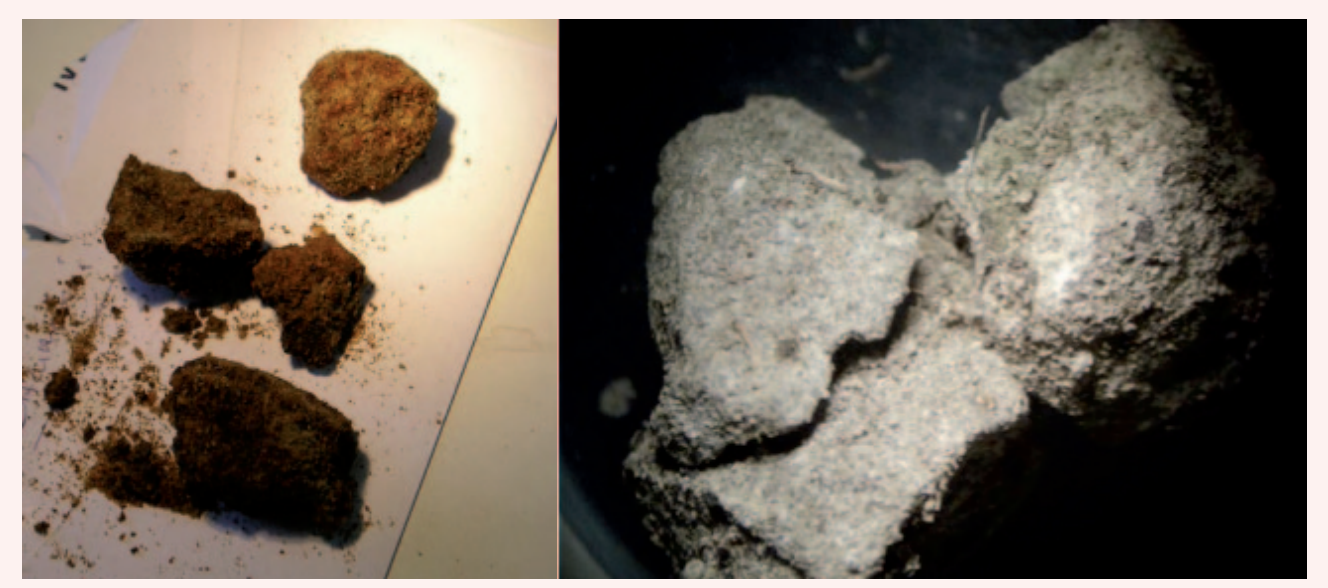
Figure 8: Chemical precipitation within wetland media leading to clogging (a) sand and iron clusters from a VF wetland, (b) media cementation from a steel slag pilot wetland in the UK.