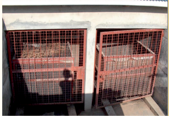
Picture 3: Filter baskets as wastewater pre-treatment in Maracha Hospital.

Maracha Hospital is a rural hospital in north-western Uganda. The sanitation infrastructure was rehabilitated in 2001 and 2002. Wastewater is treated in a vertical flow