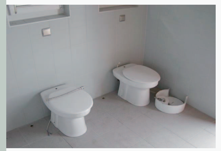
Figure 4: UDDTs (left, without separation walls) and urinals (right) during installation.

To reduce the amount of wastewater produced a urinediverting dry toilet (UDDT) was tested in the season 2002. Although the boundary conditions for the test UDDT were quite harsh, e.g. only one toilet for all daily visitors, no separate toilets for men and women, no urinal for men and up to 150 users per day, the results were promising (Kaschka, 2005).