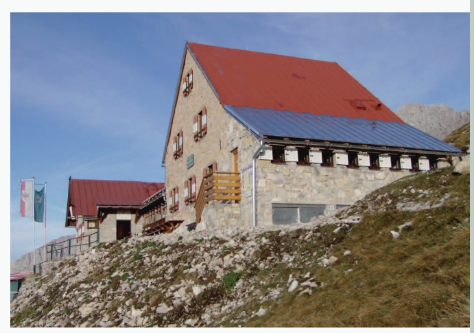
Figure 3: Bettelwurf Hütte with new sanitation facility and chambers for faecal matter (lower right corner).

Already in the first year of operation high acceptance of the system could be achieved. It has to be noted that the person running the refuge has huge impact on the overall performance of the system.