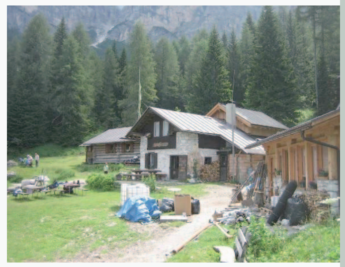
Figure 5: Refugio Casera Bosconero.

The integrated system (Figure 6) consists of the following: Wastewater is separated into greywater, urine and faecal matter. A squatting type separation toilet was installed for daily visitors (Figure 7) whereas sitting type toilets were installed for overnight guests. Furthermore kitchen wastes are shredded in a kitchen mill. The four fractions are treated using different concepts. In particular a subsurface horizontal flow vegetated bed planted with local