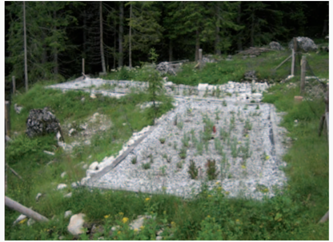
Figure 8: The constructed wetland system (Picture: G. Langergraber).

vegetation (Figure 8) is installed for treating grey and yellow water. Anaerobic digestion (Figure 9) is used for treating brown water with the addition of kitchen waste, with the aim to recover energy directly available for the kitchen (Cossu et al., 2007). By producing biogas a main aim was to reduce the number of helicopter flights for transporting gas for cooking. The design of the system was carried out within a research project by the University of Padova from 2004-2006. The horizontal flow constructed wetland was built in 2006 and its performance was monitored in 2006 and 2007. The showing abatement of COD and total N were around 50 %, total P around 40 % and MBAS around 60 %. Among the local plants species, Mentha (mint) was the most effective in colonising the bed. The anaerobic digestion was implemented in 2007.