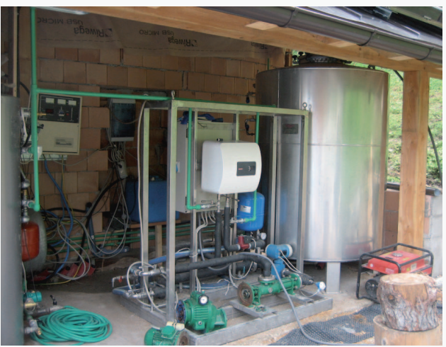
Figure 9: The biogas plant.

vegetation (Figure 8) is installed for treating grey and yellow water. Anaerobic digestion (Figure 9) is used for treating brown water with the addition of kitchen waste, with the aim to recover energy directly available for the kitchen (Cossu et al., 2007). By producing biogas a main aim was to reduce the number of helicopter flights for transporting gas for cooking. The design of the system was carried out within a research project by the University of Padova from 2004-2006. The horizontal flow constructed wetland was built in 2006 and its performance was monitored in 2006 and 2007. The showing abatement of COD and total N were around 50 %, total P around 40 % and MBAS around 60 %. Among the local plants species, Mentha (mint) was the most effective in colonising the bed. The anaerobic digestion was implemented in 2007.