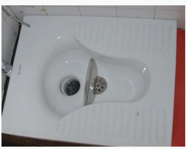
Figure 7: Squatting type separation toilet for daily visitors.