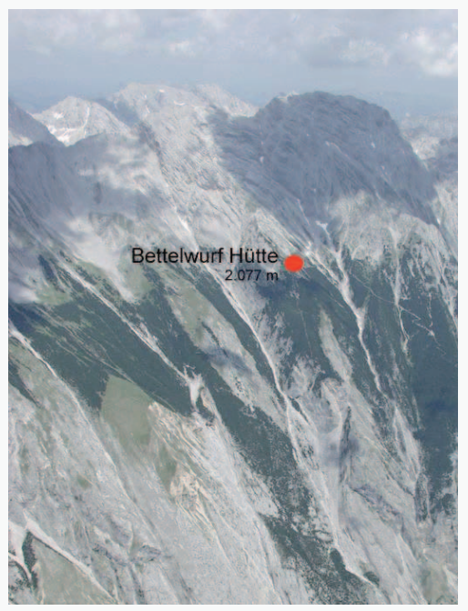
Figure 1: Location of the Bettelwurf Hütte

to and from the refuge with a cable car. There are 3 staffs and around 3'000 daily visitors per year. The Bettelwurf Hütte has 66 beds and around 2000 overnight stays per year. Due to its location above the water protection area waste from the Bettelwurf Hütte has to be transported into the valley.