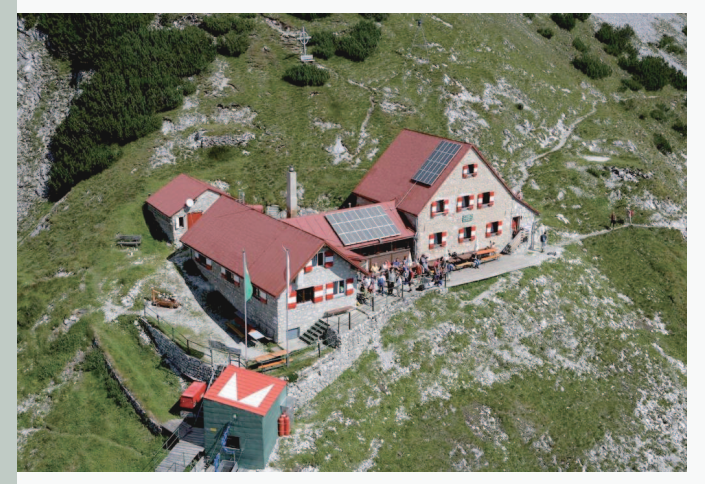
Figure 2: The Bettelwurf Hütte